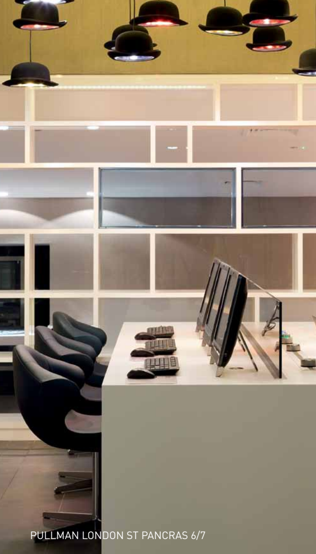
PULLMAN LONDON ST PANCRAS 6/7